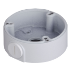
PFA135 Junction box